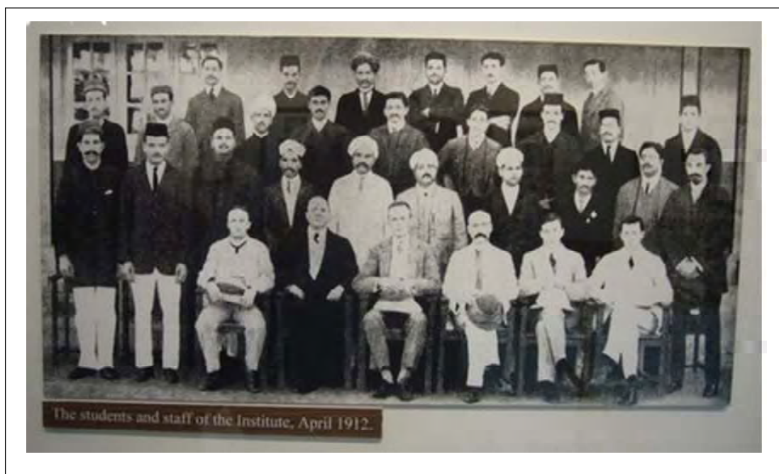
Figure 2. Students and staff of the Institute, April 1912.

Travers was sharply focused, realizing that resources, both human and material, would permit only a more limited approach.