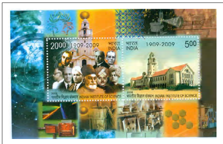
Figure 3. Commemorative postage stamps issued in December 2008.