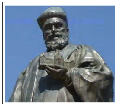
Figure 1. Statue of Jamsetji Nusserwanji Tata unveiled at the Indian Institute of Science on March 10, 1922.