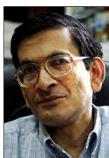
P Balaram is the Director, Indian Institute of Science, Bangalore

This account is based on editorials in Current Science (Jan 10, May 10 and December 25, 2008) and a Foreword for the publication IISc – Profile 2008–2009 , Indian Institute of Science.